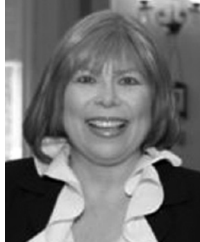
Senator Jenny Oropeza

(Post the above numbers by the telephone.)